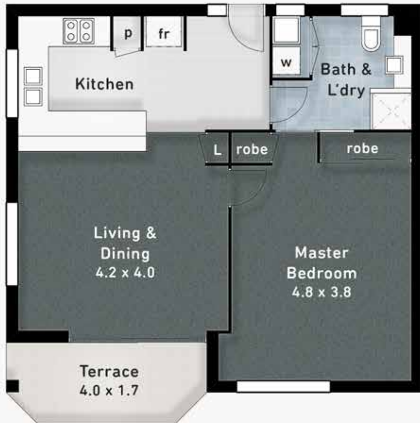
// FLOOR PLAN