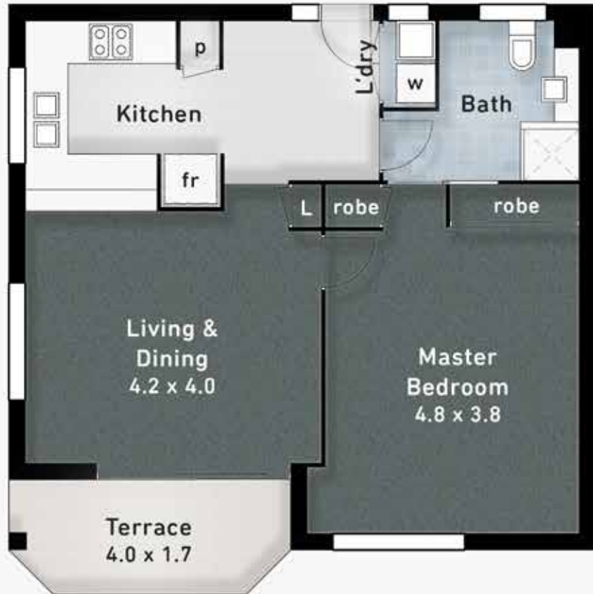
// FLOOR PLAN