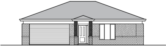
Typical Front Elevation