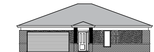
Typical Front Elevation