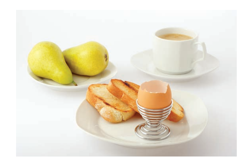
Medicines Reminder Card no. 5