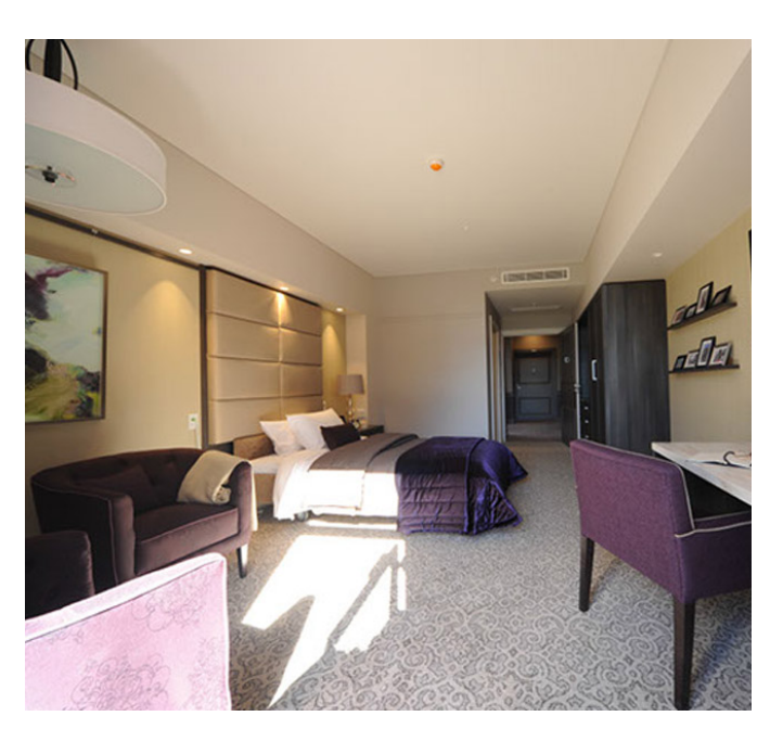
Large Single Room Cost