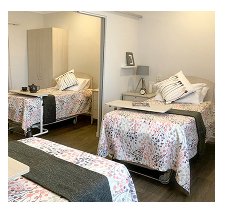
Companion Room - 3 Bed Room Cost $415,000