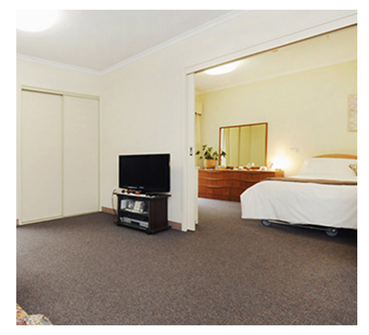
Companion Room - 2 Bed-Private Room Cost

Services and support designed to optimise your health and wellbeing.