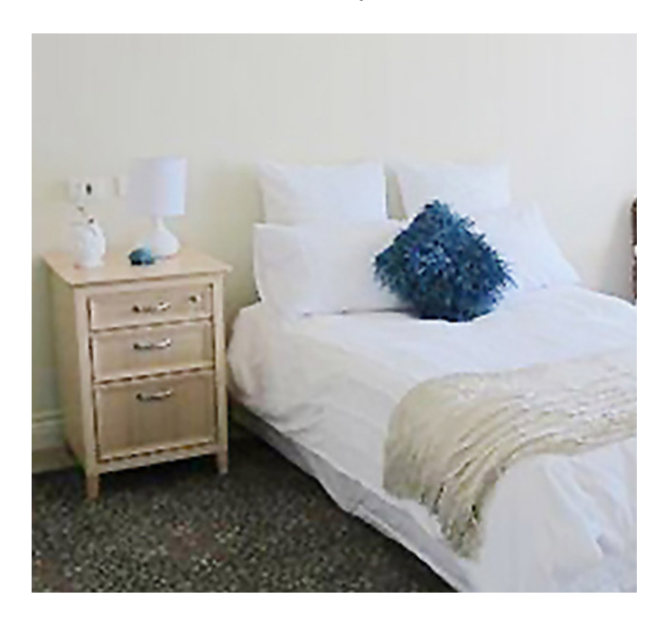
Single Private - Villetta Room Cost $570,000