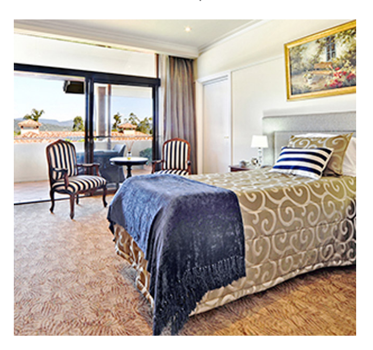
Superior - Pallazina Room Cost $750,000