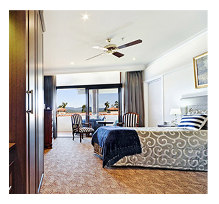
Premium - Pallazina Room Cost $750,000