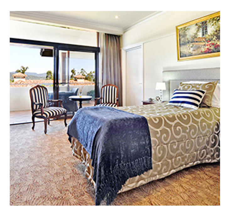
Single Private - Pallazina Room Cost $705,000